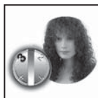
Very Curly Hair